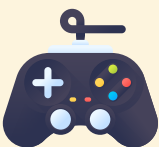
Gamified & interactive