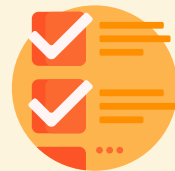
Custom Book Lists