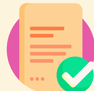
Student Book Reviews