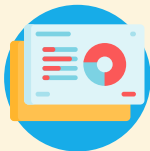
Robust Teacher Reports

"My teachers love Book Taco because it is student-friendly and customizable. I am very pleased and the students love it! They ask every day if they can do their Book Taco!"